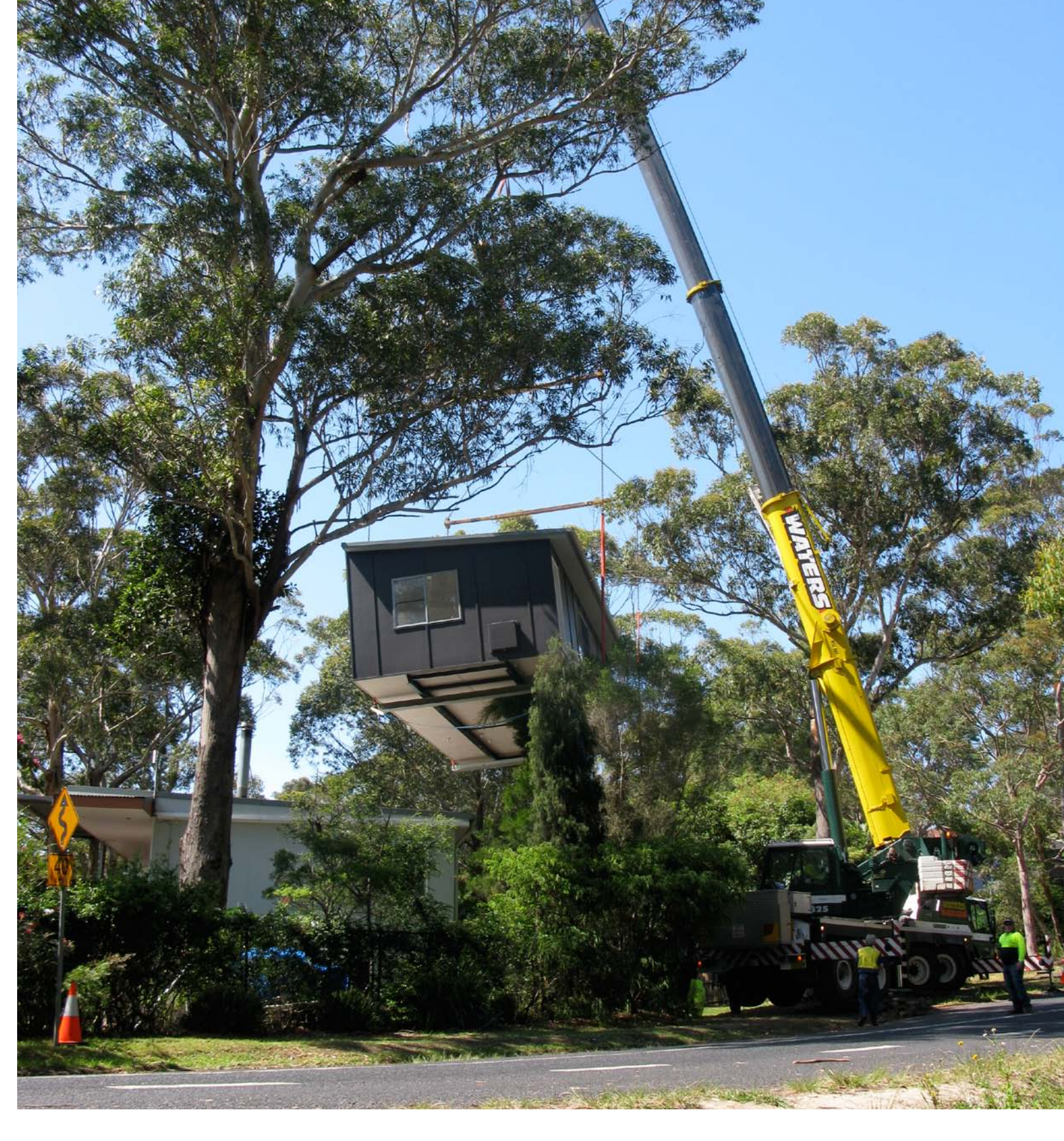
66 It created quite a spectacle when the prefab was being craned into place, and all the locals were out on the street watching

"We were all holding our breath as the prefab was lifted over the roof of the existing house - the guys who operate the cranes are pretty amazing. It created quite a spectacle when the prefab was being craned into place, and all the locals were out on the street watching," she says.